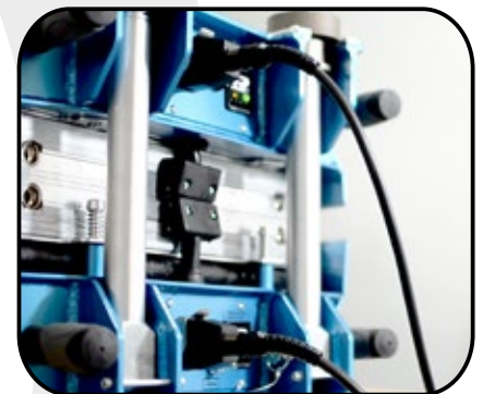
E-Komp 800x500 230V 16A with separate power connections.