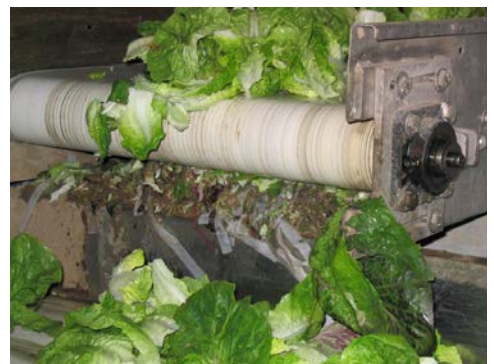
CLINA 20CK conveying lettuce.