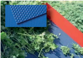
NS07AY - Double PU cover with Y pattern on the bottom cover.

Belts with double PU covers for vegetable harvesters and sliced vegetable washers.