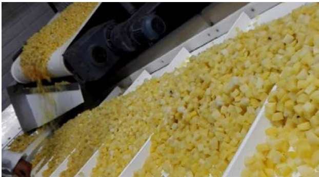
CLINA S20UFMT with transverse cleats conveying potatoes.

Packaging - PVC belts with type Q, G2, D top cover pattern. Thermoweldable extruded belts for canning process.