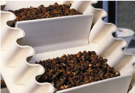
CLINA belt with Runer and transverse cleats on an inclined conveyor for hazelnuts.