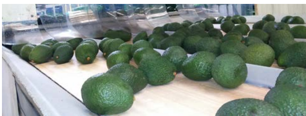
FEBOR 12CF WH conveying avocados.