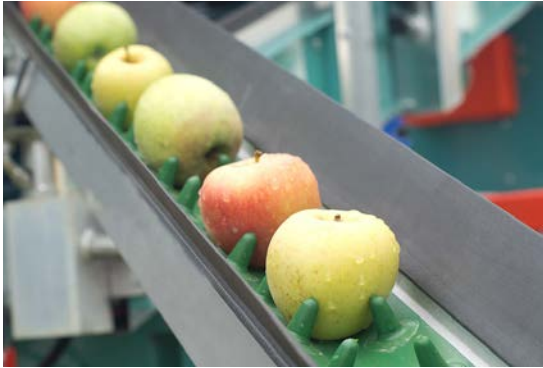
Special short finger profiles on a harvesting machine for thin skinned fruits (apple).