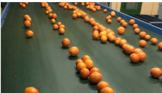
FEBOR 12GF-GR_EU conveying oranges.