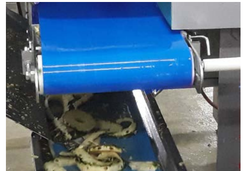
NOVAK S09UF and NOVAK 20CK conveying pineapple residue.