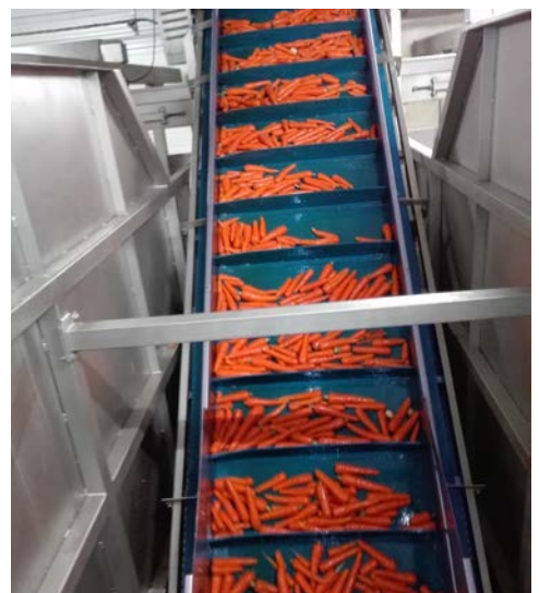
FEBOR 19CK on inclined conveyor with transverse cleats for carrots.