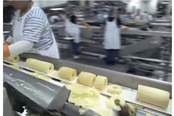
Conveying of cut pineapples on ESPOT belt with sealed edges.