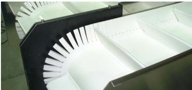
White PVC belt with longitudinal cut profiles.