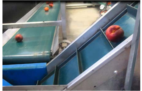
FEBOR 14CF GR EU with transverse cleats and longitudinally cut profiles.